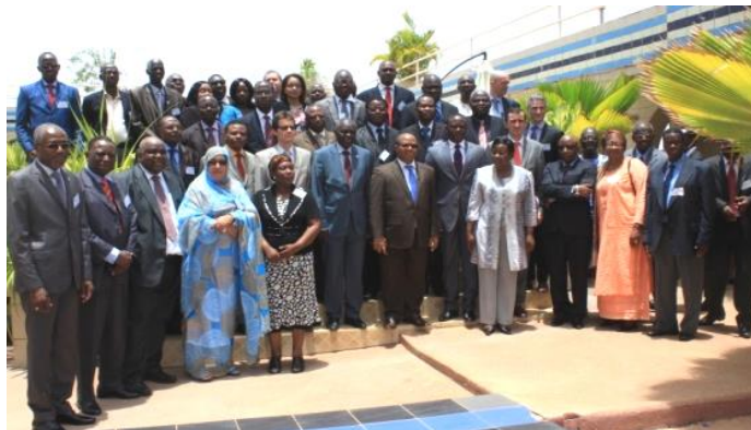
Regional Steering Committee Meeting Participants

It followed the second Institutional Steering Committee meeting between the EU, ECOWAS and UNIDO, which was held on 23 rd March. A three day Internal Technical Workshop was also organized by UNIDO, enabling the NTCs to acquire better knowledge on how to support the implementation of the programme in their respective countries.