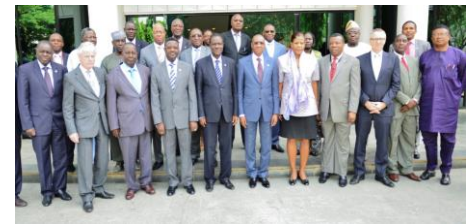
Personalities at the Launch: Presidents of the ECOWAS & UEMOA Commissions, UNIDO Representative to Nigeria, EU Head of Cooperation, GIZ Director for Africa

The WAQSP is one component of a larger EU funded programme on competitiveness and private sector support for the region.