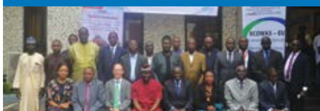
Group photo of the validation workshop

The regional workshop on the framework document for the ECOWAS quality and industrial database was held from 23 to 25 August 2017 in Abuja, Nigeria. Participants included the WAQSP National Focal Points (NFP) and National Technical Coordinators (NTC), the representatives of national institutions in member States dealing with statistics and representatives of the private sector in the region, including the Federation of West