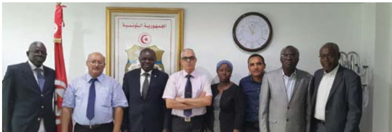
Picture of the two delegations