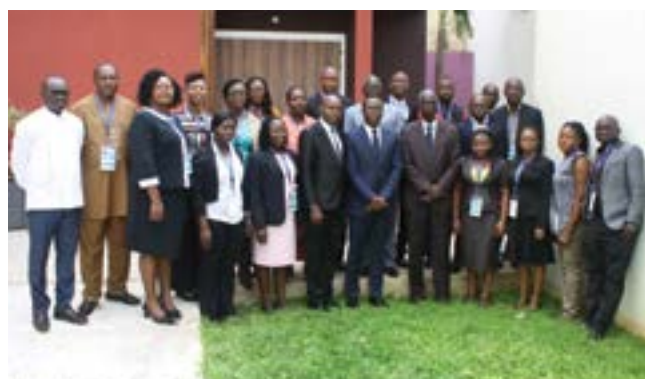
Group Picture of participants

During this mission, a partnership agreement was signed between the Tunisian Accreditation Body (TUNAC) and SOAC. In this regard, the ECOWAS Commission plans