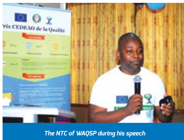
The NTC of WAQSP during his speech