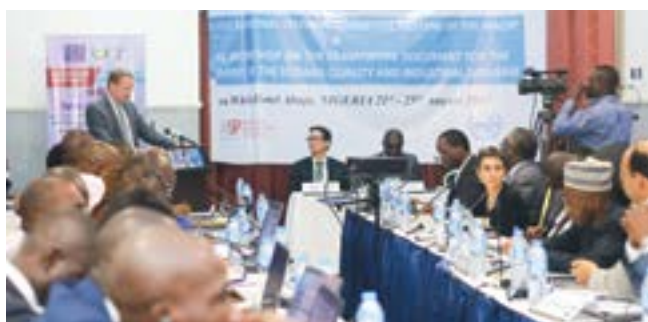
Speech of the European Union representative

A new milestone reached during the Abuja regional workshop