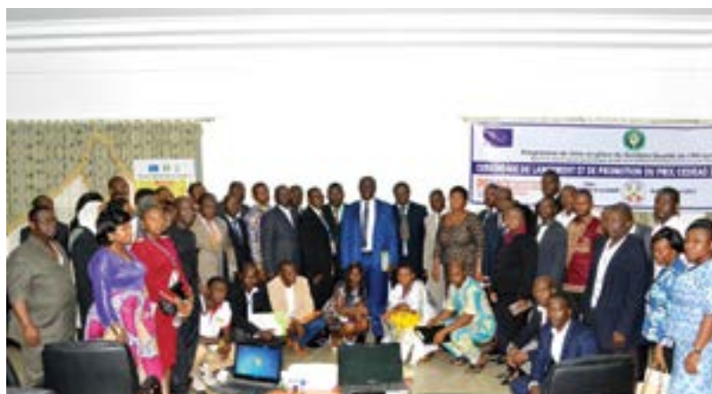
Group Picture of participants