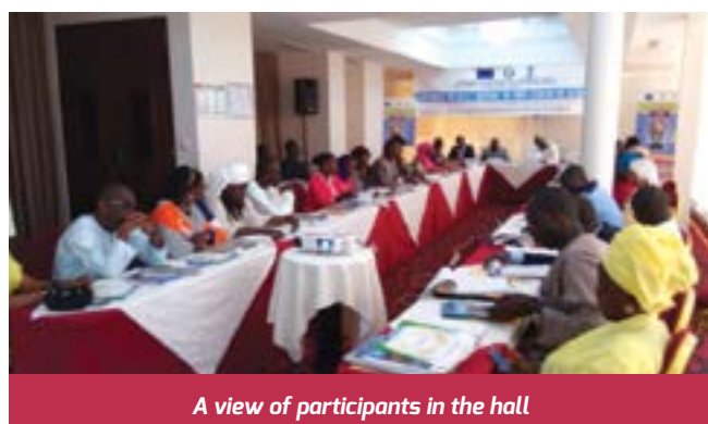
A view of participants in the hall

The ECOWAS Quality Award was launched on Friday 9th June 2017 at the Hotel Fleur de Lys in Dakar. On this occasion, the General Secretary of the Ministry of Mines