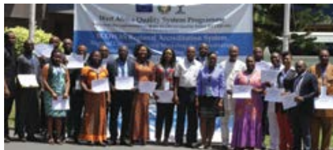
Group picture of the candidates evaluators