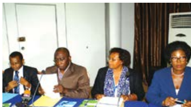
(From left to right) The authorities representing UNIDO, The Guinean Ministry of Industry, European Union and ECOWAS