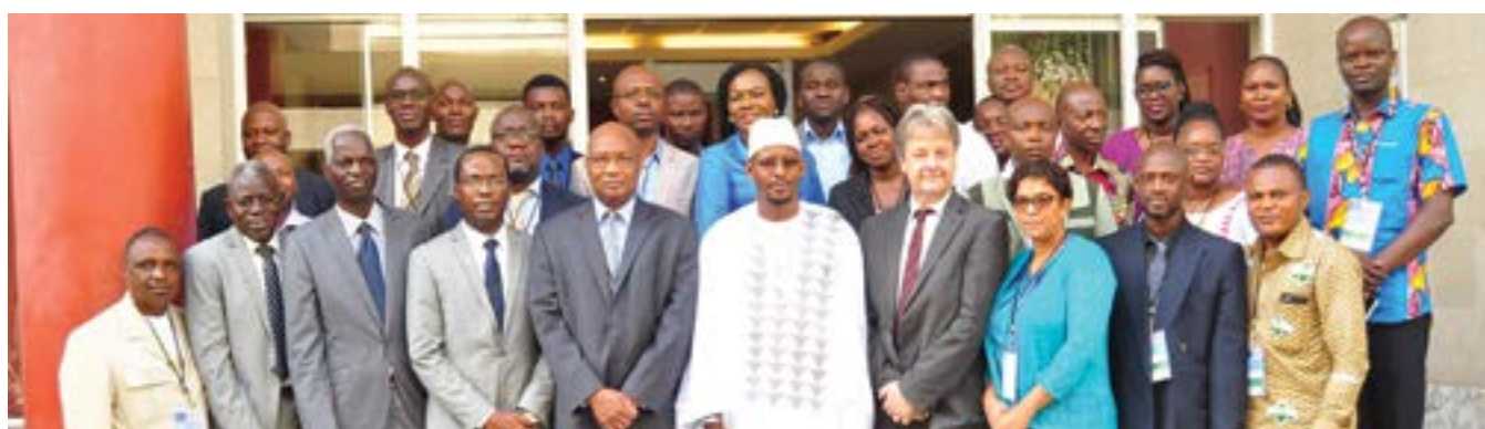
Group picture of participants with the Senegalese Minister in charge of Quality, at the workshop from the 2nd to 3rd October 2017

to organize the RAS constitutive meeting in November 2017, to elect a President and adopt its internal rules. Following this meeting, in the same dynamic, the WAQSP also organised in Dakar, a regional workshop for the realization of inter laboratory comparison in the food field in West Africa, from the 2nd to the 3rd of October 2017. Mr. Moustapha Diop, Minister for Industry and Small and Medium Industries in Senegal, recalled thus that "international standards requires the carrying out of inter-comparison campaigns to ensure the reliability of measurements". In fact, inter-comparisons or aptitude tests are one of the tools which enable the assessment of the competence of laboratories involved in the control of quality of products. However, these inter laboratory comparisons remain one of the weakest links in the competence monitoring system of agri-food laboratories of the region. To alleviate this deficit, the WAQSP has chosen to support the laboratories of the region through two inter-laboratory comparison campaigns currently under preparation; food physico-chemical analysis campaign and food microbiology campaign. Twenty-one (21) West-African laboratories, in total, will benefit from these campaigns, planned for the beginning of the year 2018. The expected result is the demonstration and improvement of the competence of laboratories of the region, in accordance with the international standards ISO IEC 17025.