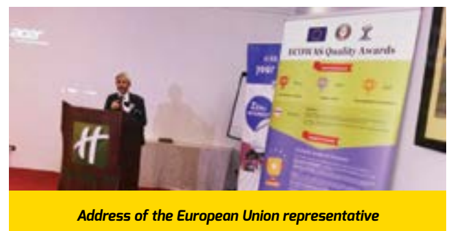
Address of the European Union representative