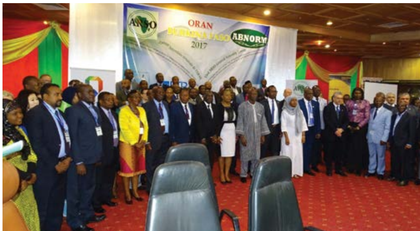
Group Picture of participants