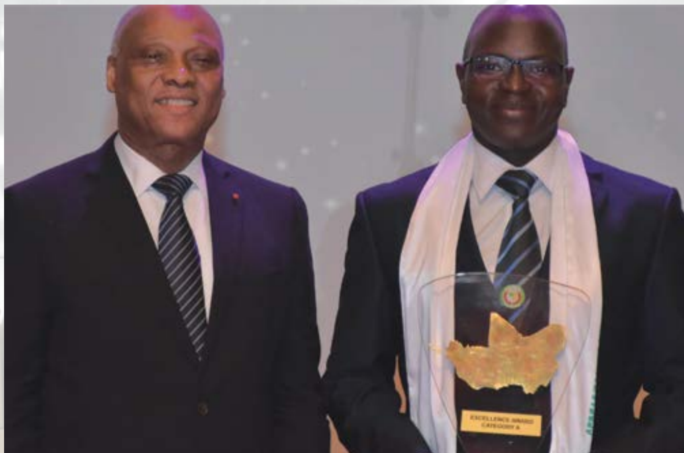
The Representative of the Winner with the Ivorian Minister of Industry

Furthermore, you will see that FILTISAC has Coca Cola's accreditation to produce preforms and caps for fizzy drinks and mineral water. We are also FSSC certified for these two activities. We are also compliant with Nestlé and Unilever's social and environmental (SEDEX) requirements.