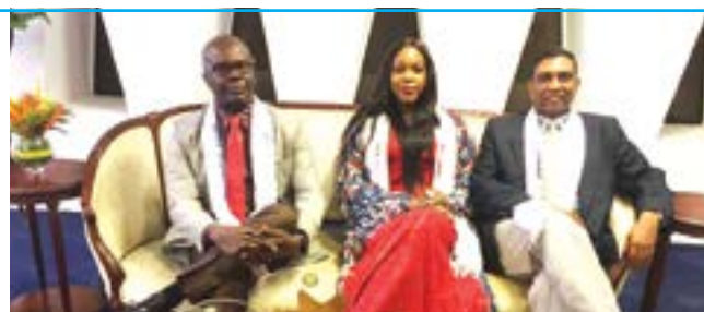
Representatives of the three winning companies from Nigeria at the ECOWAS Quality Award

The Nigerian Quality Award was launched in April 2017 by NQIP with the support of WAQSP. The award ceremony will take place in Lagos on 22 November 2017.