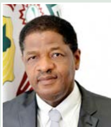
► Marcel Alain de Souza President of the ECOWAS Commission