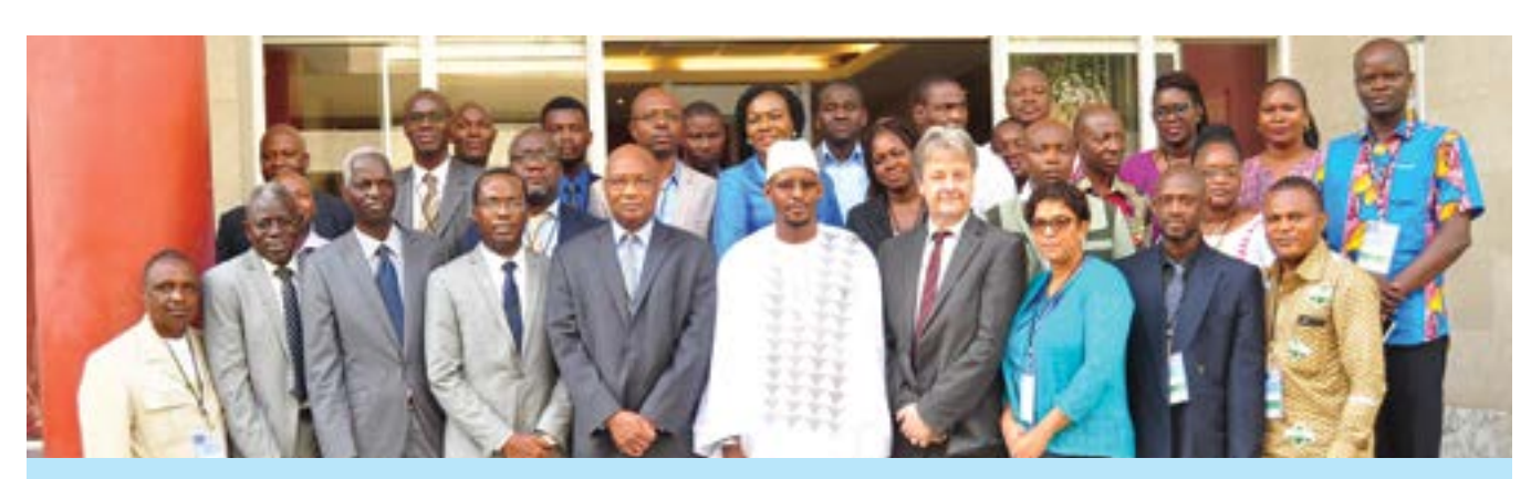
Group picture of participants with the Senegalese Minister in charge of Quality, at the workshop from the 2nd to 3rd October 2017

to organize the RAS constitutive meeting in November 2017, to elect a President and adopt its internal rules. Following this meeting, in the same dynamic, the WAQSP also organised in Dakar, a regional workshop for the realization of inter laboratory comparison in the food field in West Africa, from the 2nd to the 3rd of October 2017. Mr. Moustapha Diop, Minister for Industry and Small and Medium Industries in Senegal, recalled thus that "international standards requires the carrying out of inter-comparison campaigns to ensure the reliability of measurements". In fact, intercomparisons or aptitude tests are one of the tools which enable the assessment of the competence of laboratories involved in the control of quality of products. However, these inter laboratory comparisons remain one of the weakest links in the competence monitoring system of agri-food laboratories of the region. To alleviate this deficit, the WAQSP has chosen to support the laboratories of the region through two inter-laboratory comparison campaigns currently under preparation; food physico-chemical analysis campaign and food microbiology campaign. Twentyone (21) West-African laboratories, in total, will benefit from these campaigns, planned for the beginning of the year 2018. The expected result is the demonstration and improvement of the competence of laboratories of the region, in accordance with the international standards ISO IEC 17025.