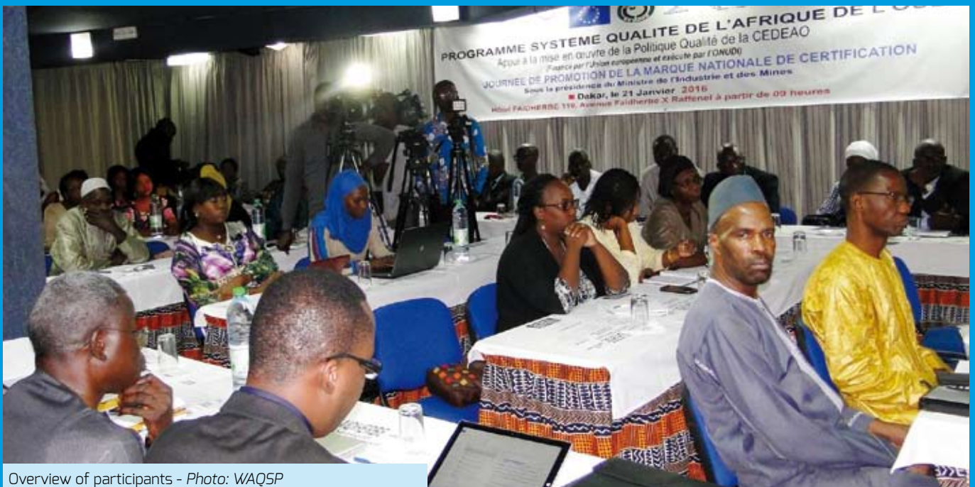
Overview of participants - Photo: WAQSP

The meeting was covered by the press, national television (RTS 1) and the Pan African News Agency (APA News).